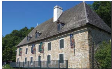
Moulin du Petit Pré