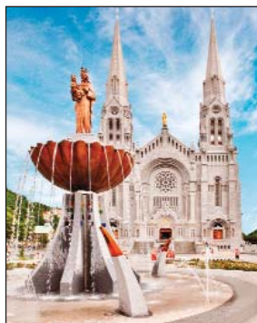
Shrine of Sainte-Anne-de-Beaupré

At the Saint Anne Museum , discover the rich history of devotion to Saint Anne. Admire many works of art, as well as the largest collection of ex-votos in North America. Schedule: the Sanctuary is