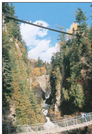
Canyon Sainte-Anne, Compagnie McNicoll

► Still on Route 360, drive through the underpass and you will soon see the paper mill located at the mouth of Sainte-Anne river. Drive towards Saint-Joachim and Cap-Tourmente.